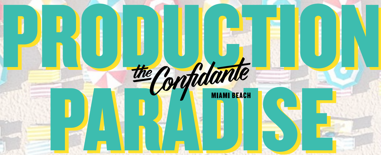
PHOTO • FILM • TV • MUSIC VIDEOS • CATALOG • PRESS TOURS • INTERVIEWS • BRAND SHOTS • ACCOMMODATIONS