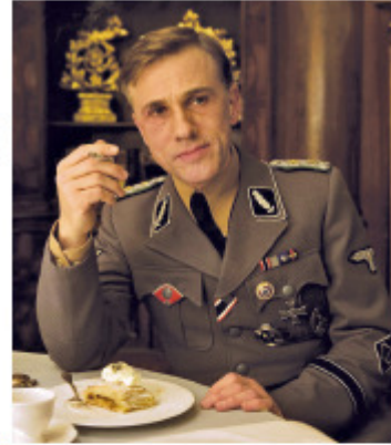
THESPIANS AND TROPHIES: From left, "Up in the Air," "Precious" and "Inglourious Basterds" led the way Thursday with three noms each.